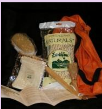
Lymphatic Body Brush Kits

you hear staged, or deliberate, laughter, it prompts more activity in your brain's anterior medial prefrontal cortex, which helps you understand other people's emotions.